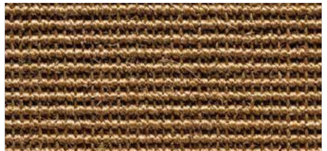
Mini Boucle 8047