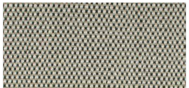
KOM Bi colour 203