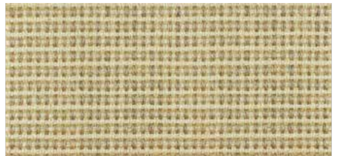
KOM Bi colour 220