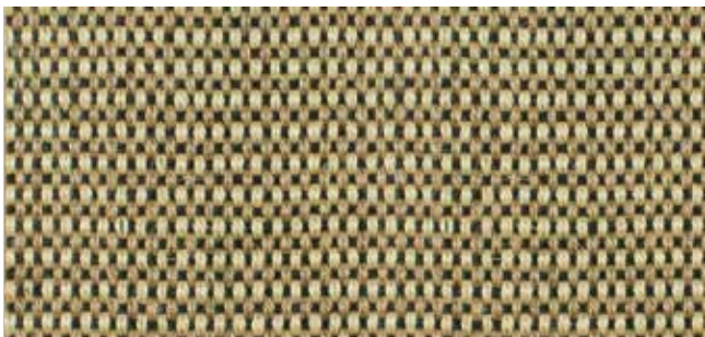
KOM Bi colour 217