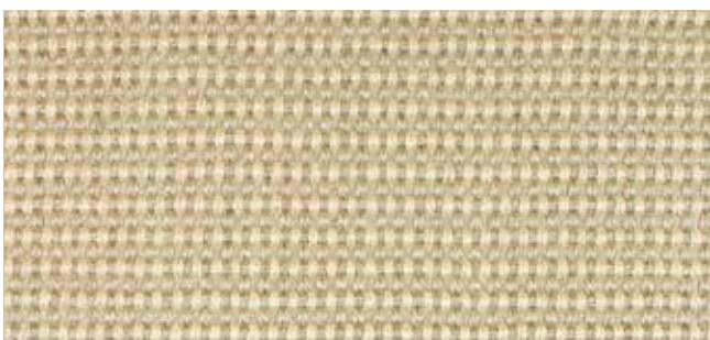
KOM Bi colour 245