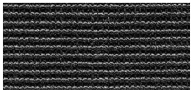
Mini Boucle 8070