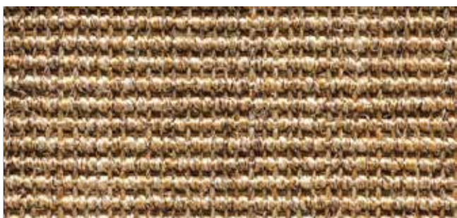
Mini Boucle 8011