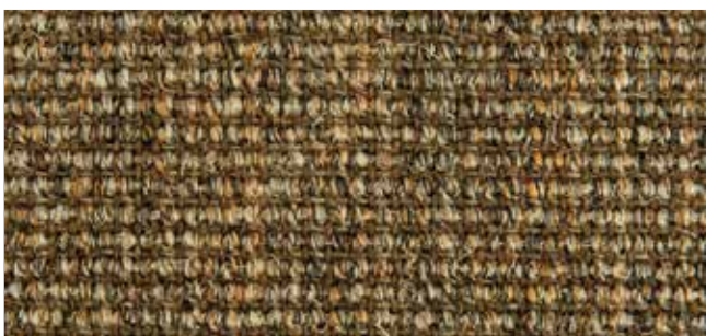
Mini Boucle 8033