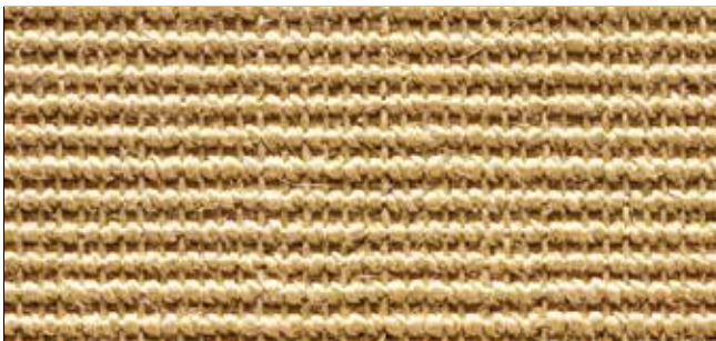
Mini Boucle 8036