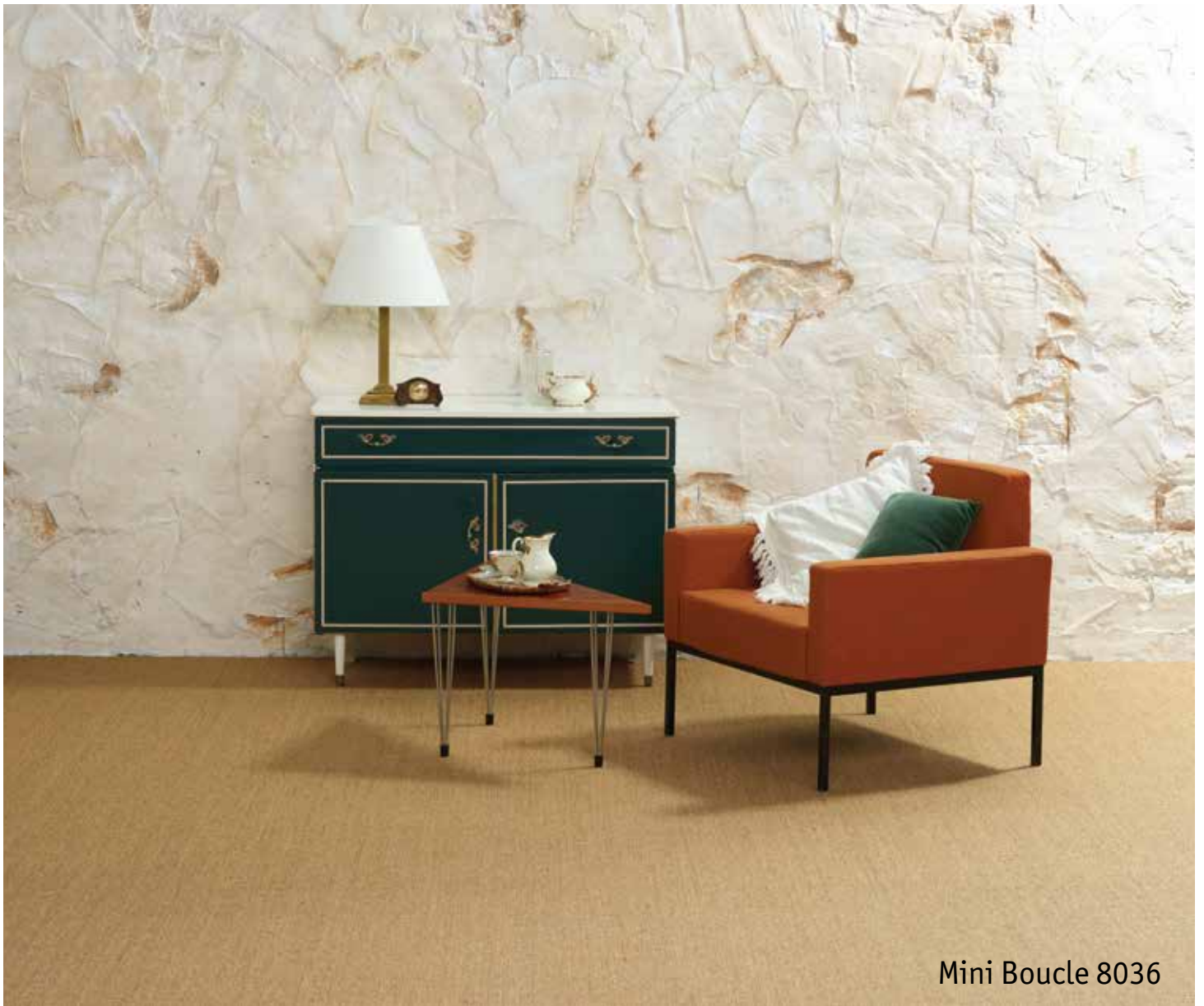
Mini Boucle 8036