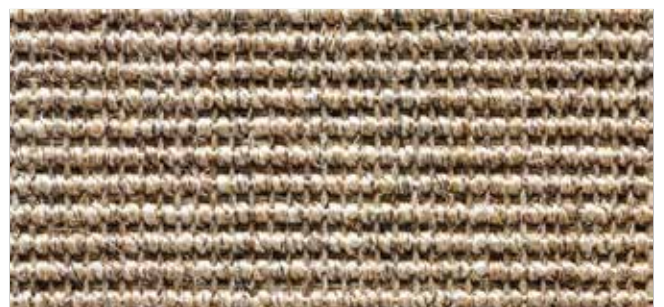
Mini Boucle 8042